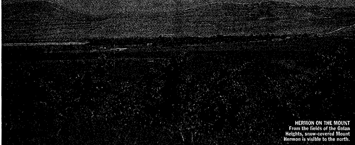
HERMON ON THE MOUNT From the fields of the Golan Heights, snow-covered Mount Hermon is visible to the north.

O n a sun-soaked May morning last spring, a piercing two-minute siren brought Israel to a halt, as it does every year on the nation's Remembrance Day. People everywhere stood in silence, heads bowed, to commemorate soldiers who have died for the country, including those who perished during Israel's capture of the Golan Heights from Syria in the Six Day War of 1967. It may be only a matter of time before a peace treaty returns the Golan Heights to Syria, and many say the stalled peace