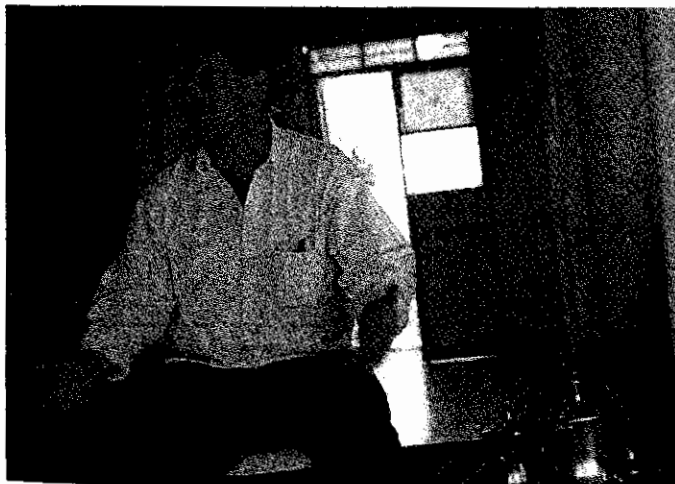
TAKE ME TO YOUR LEADER The head of the Golan Heights' only remaining Syrian Muslim sect, the Druse, welcomes tourists to his village.

This political turmoil has unfolded in a landscape of stunning variety and beauty. Nature reserves teem with gazelle, wild boar, fox, vipers, agamas (which look like miniature iguanas) and waterfowl. Between April and October, wildflowers stud the hills and the riverbanks bristle with oleander, willow and flowering hemp. In the northern Heights, you'll find apple, pear, cherry and blueberry groves, while to the south, in the subtropical Hula Valley, farmers grow plums, apricots, nectarines, mangoes, avocados